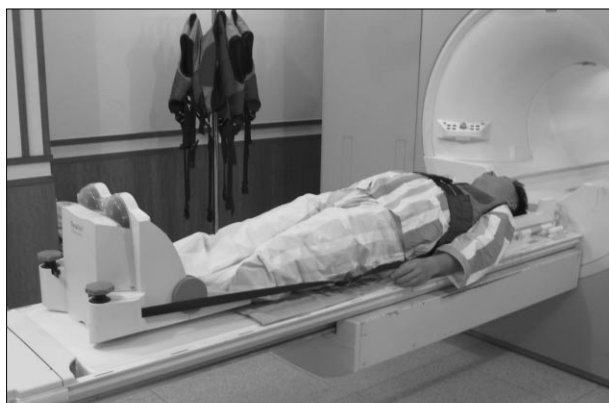
Fig. 1. Patient in axial loading with the device (DynaWell, DynaMed AB, Stockholm, Sweden), which consists of a harness and a foot-operated device connected by straps. By appropriately tightening the straps, the amount of axial load can be controlled.

A 67-year-old male presented with a 1-year neurogenic claudication. The pain was exacerbated by standing and especially by walking. If he walked beyond 10 minutes, numbness in both legs was developed. The pain was relieved by squatting and by decumbency. Pulsation of both dorsalis pedis arteries were felt well. The patient had no medical problems except hypertension. EMG of the legs revealed no abnormality and CT angiography revealed no stenotic lesions of vessel for the lower extremities. He had taken medications and undergone physical therapy for 6 months. He still complained of the pain and could not walk for more than 5 minutes. Although the patient had undergone a nerve block in our clinic, the pain was not relieved. MRI in decumbency showed no obvious lesion that could be associated with his symptoms. The patient was checked with axial loaded MRI. A T2-sagittal image demonstrated that the thecal sac was compressed posteriorly due to protrusion of the dorsal fat pad. A T2-axial image showed that the size of the thecal sac was significantly